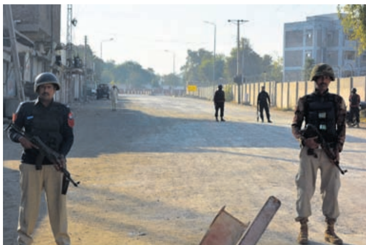
Security officials guard a blocked road leading to a counterterrorism center after security forces starting to clear the compound seized earlier by Pakistani Taliban militants in Bannu, a northern district in the Pakistan's Khyber Pakhtunkhwa province, Tuesday, Dec. 20, 2022.

— Pakistan's special forces raided a police center in a